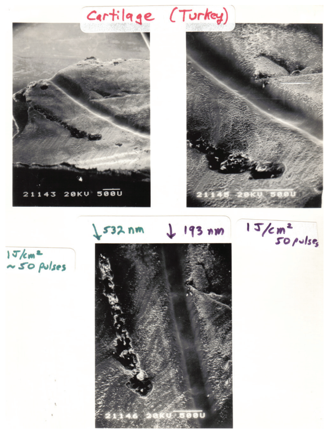
▲ Fig. 1. Three scanning electron micrographs of laserirradiated turkey cartilage, recorded from different perspectives and with different magnification. In the bottom micrograph, arrows indicate the regions irradiated with 193-nm light and 532-nm light. For each wavelength, the fluence/pulse and number of pulses of irradiation are given.