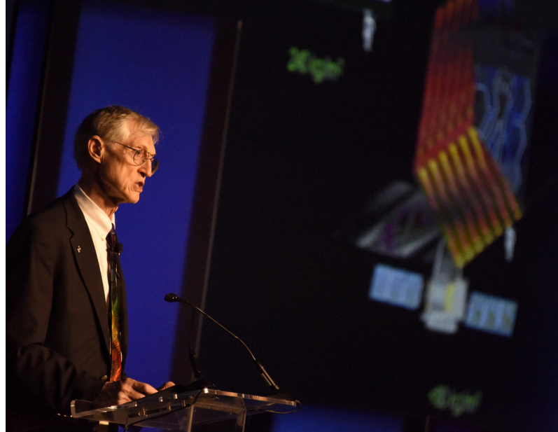
PICTURED: John Mather presents at CLEO.

As part of a special International Day of Light celebration at CLEO in San Jose, Calif., USA, Nobel Laureate John Mather, NASA's Goddard Space Flight Center, USA, delivered a presentation on future discoveries that may be seen through NASA's James Webb Space Telescope (JWST), discussed the expanding views of the universe, and outlined the technology that will lead us to deeper understanding.